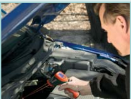
Max hold indicates and holds the peak temperature for easy identification of hot spots