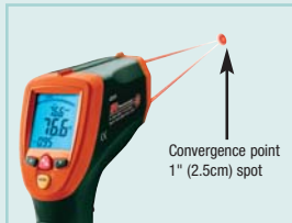
Two laser points converge at a distance of 50"/127cm ) and form a 1" (2.5cm) spot.