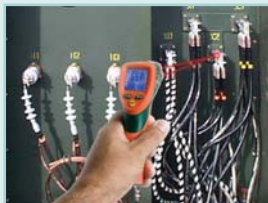
Fast response captures hot spots